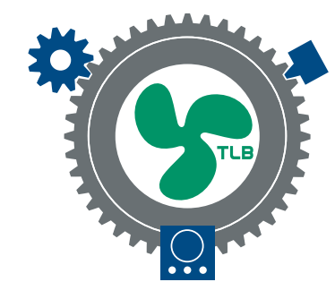
Turning, Locking & Braking Systems

The Twiflex system comprises a Turning gear, Locking device, and shaft Brake, together with a power unit and a control panel for local operation of the system close to the equipment. The TLB can be used for continuous turning or as an indexing system, using a simple hydraulic 'push-pull' arrangement with the brakes and brake disc to inch the propeller shaft for maintenance and accurate alignment.